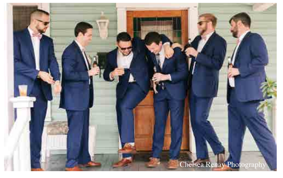
Wedding Preparations & Accommodations